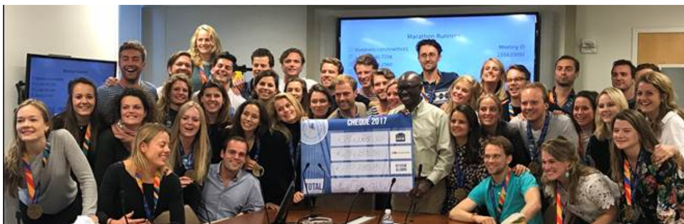
Photo: Stichting Run for Human Rights Watch presenting their cheque to Human Rights Watch in New York.