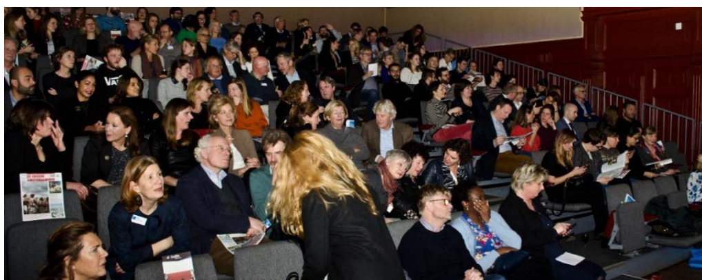
Photo: Audience Human Rights Weekend 2018