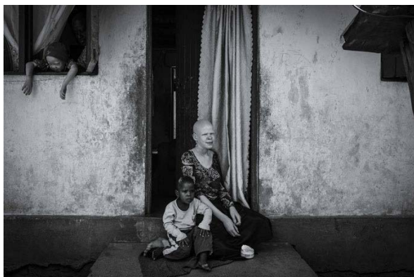
part of the series 'Leven in de Schaduw'

Because of a deadly myth that people born with albinism in Tanzania possess magical qualities and their organs and limbs bring prosperity, they are hunted, dismembered, and left behind to die by those who sell their body parts for thousands of dollars to witch doctors. Children with albinism live in fear of attack and are often separated from their families and communities to live in temporary shelters.