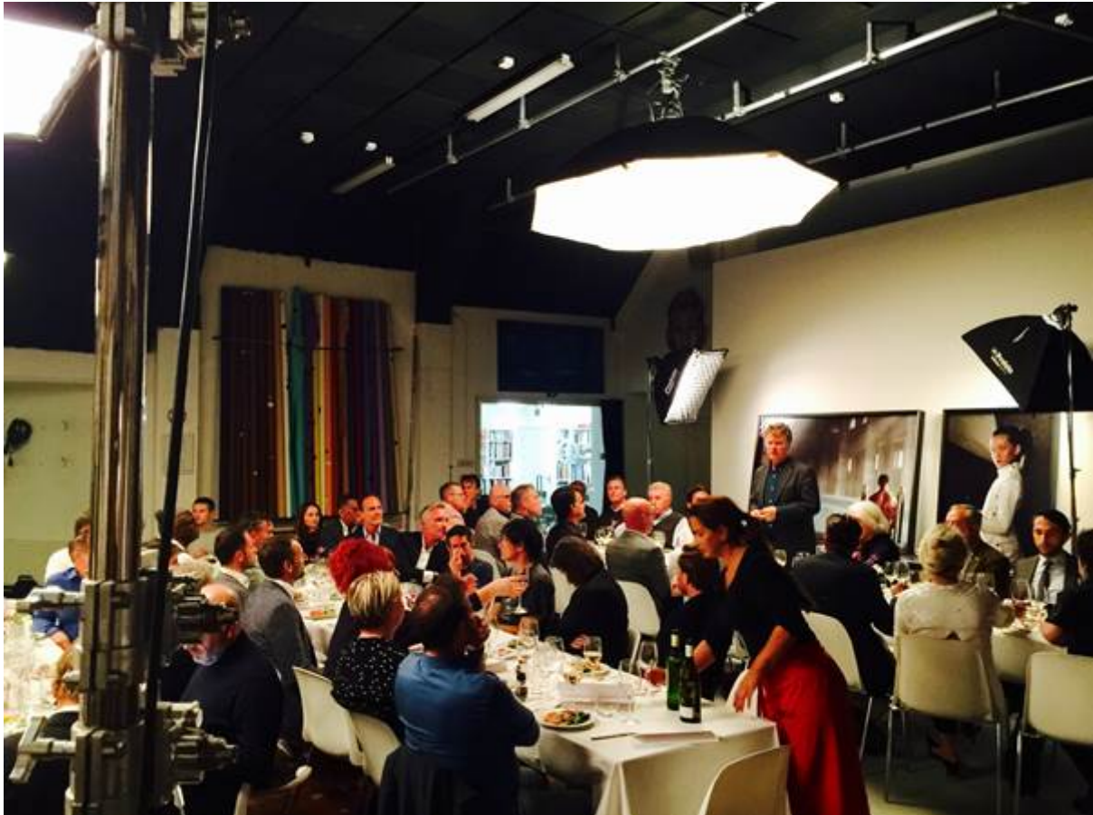
Photo: Guests in Erwin Olaf's atelier 2017